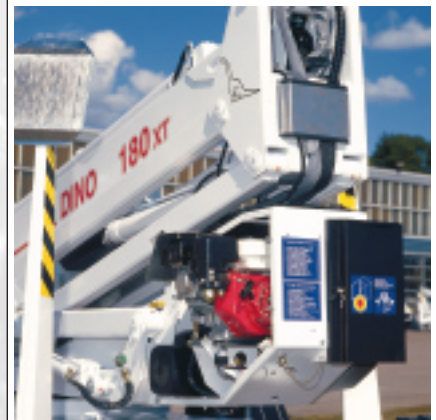
The platform can be fitted with an optional Honda petrol engine.