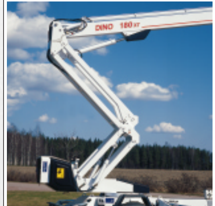
The articulated riser gives improved up and over capability.