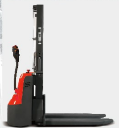
Compact design With very small turning radius, offer a range of application option in very confined space.