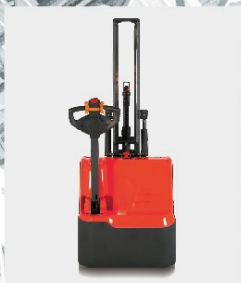
Mast with excellent visibility for wide view of the forks.