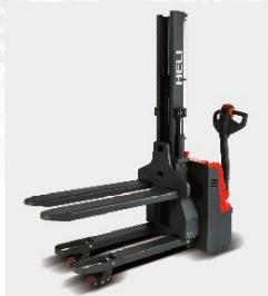
With double decker ,mast lift 1000kgs and support arm lift 1000kgs, total load is 1000kgs if use double pallet.